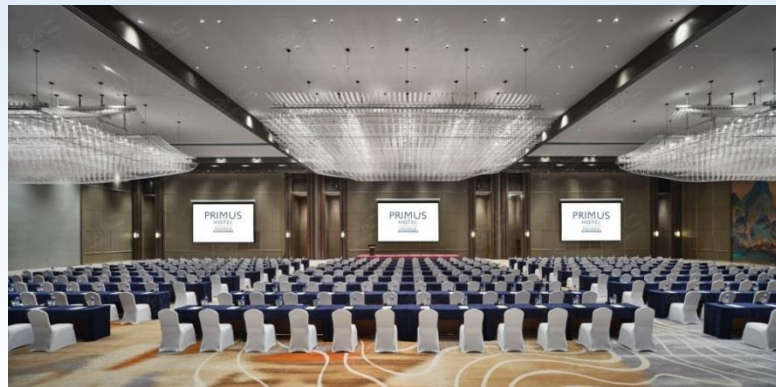
General assembly hall