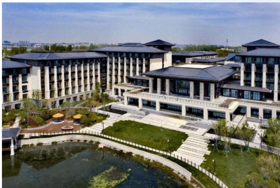
Hotel full view