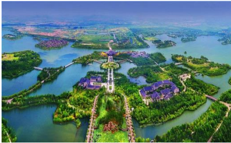
Pan'an subsidence Lake