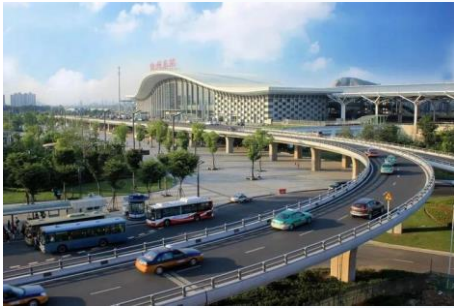
East railway station