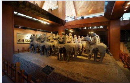
The Chuwang tomb