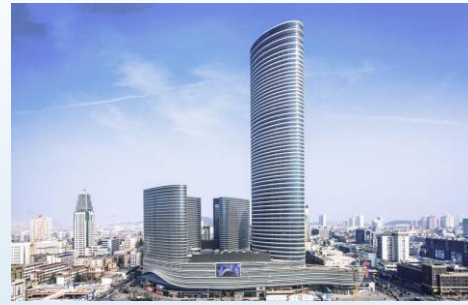
Suning plaza (62 floors)