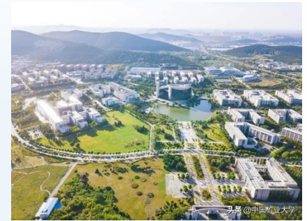
CUMT full view