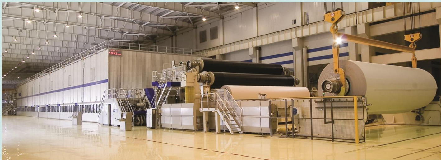
大型现代化年产 45 万吨高档彩印新闻纸生产线